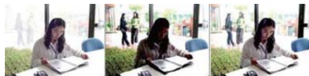
Over-exposure to diminish background Under-exposure to darken indoor environment With WDR featured camera to auto adjust lighting.

This product provides lighting enhance functionality to provide clear images with excessive back light. Mainly, this functionality is to auto-adjust lighting/exposure in the dark and light area in the captured picture. WDR functionality enables the capture and display of both bright areas and dark areas in the same frame, in a way that there are details in both areas, i.e. bright areas are not saturated, and dark areas are not too dark.